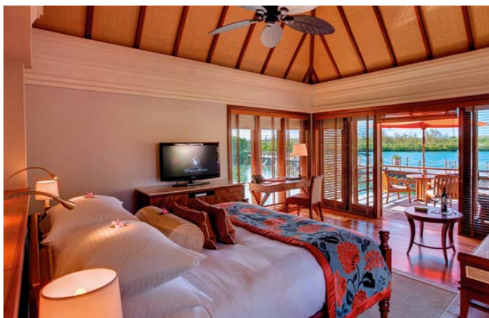
64 Junior Suites - 70 m 2

All the suites and villas are equipped with air-conditioning, bathroom with bathtub, double vanities, separate shower/WC, hair dryer, minibar, safe, desk, satellite TV/DVD/CD player, Hi-Fi, telephone/answering machine, Apple Mac mini, complimentary WIFI internet access, furnished terrace or balcony.