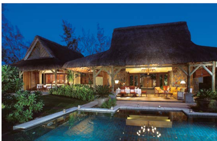
1 Princely Suite - 350 m 2

In addition to the standard facilities the suites comprise of a bathroom with a whirlpool bathtub, outdoor soaking bath, separate living room with dining/ seating area, guest shower/ WC.