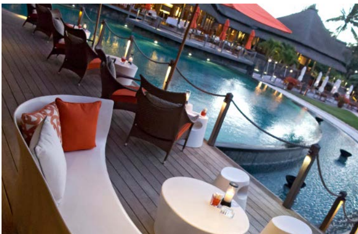
The Laguna Bar (opening hours: 09.00 - 00.00)

An incredible spot with a beautiful and peaceful atmosphere where one can enjoy an aperitif before dinner while listening to relaxing music and enjoying the beauty of the surroundings