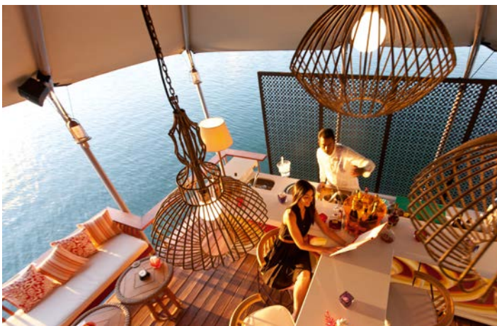
Barachois - floating bar (opening hours 18h00 to 23h00)

The Lotus Lounge Bar (opening hours: 18.30 - 23.30) The trendy Lounge Bar is located in the main building, adjacent to L'Archipel restaurant. Ideal for an aperitif before dinner and after dinner drinks in an elegant and intimate atmosphere.