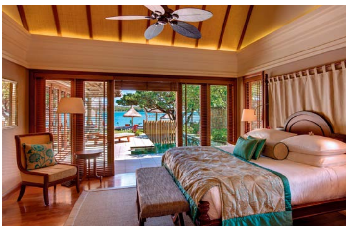
12 Villas - 130 m 2