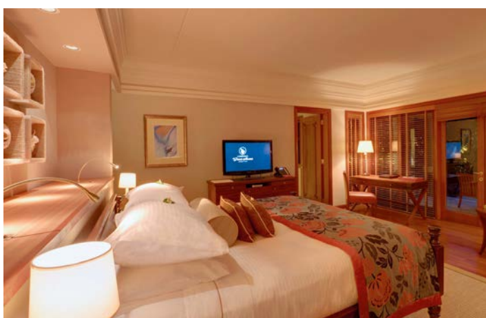
12 Family Suites - 86 m 2