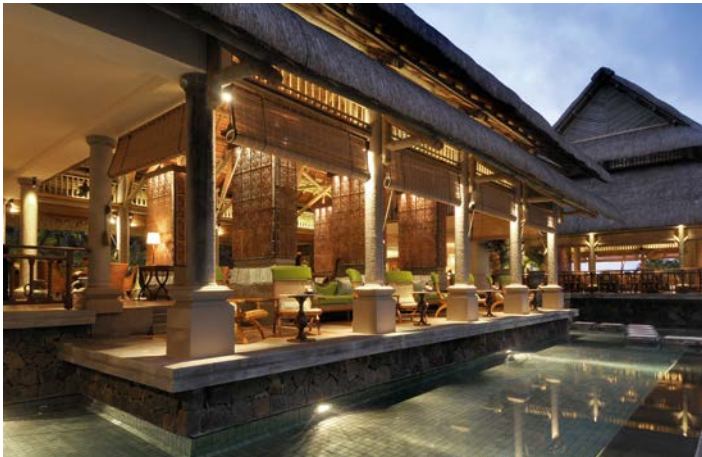
Lotus Lounge Bar (opening hours: 18.30 - 23.30)

The Lotus Lounge Bar (opening hours: 18.30 - 23.30) The trendy Lounge Bar is located in the main building, adjacent to L'Archipel restaurant. Ideal for an aperitif before dinner and after dinner drinks in an elegant and intimate atmosphere.