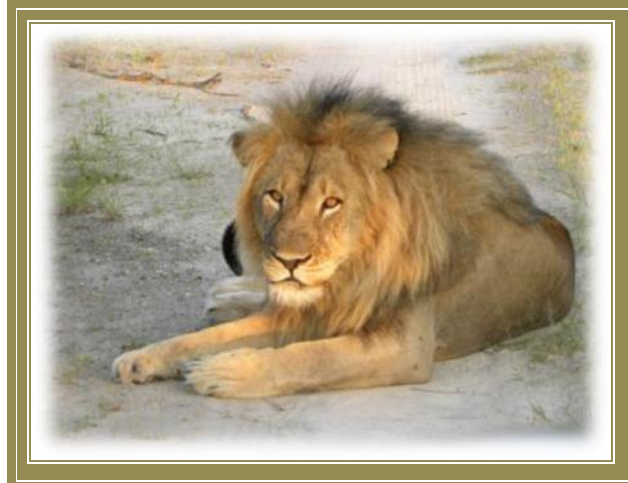
Lion in Hwange National Park