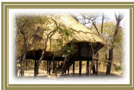
Elevated Tree House