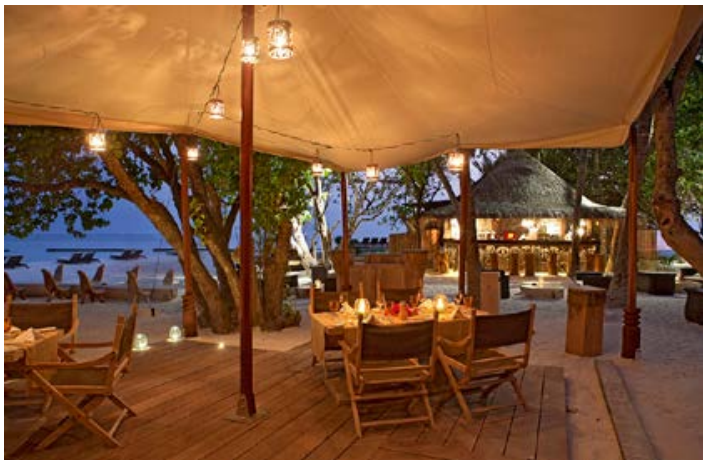
Alizee beach grill

Type of menu: Breakfast-American Breakfast Lunch / Dinner-Interactive buffet with live station. Italian, Asian, live salad and live grill two times a week.