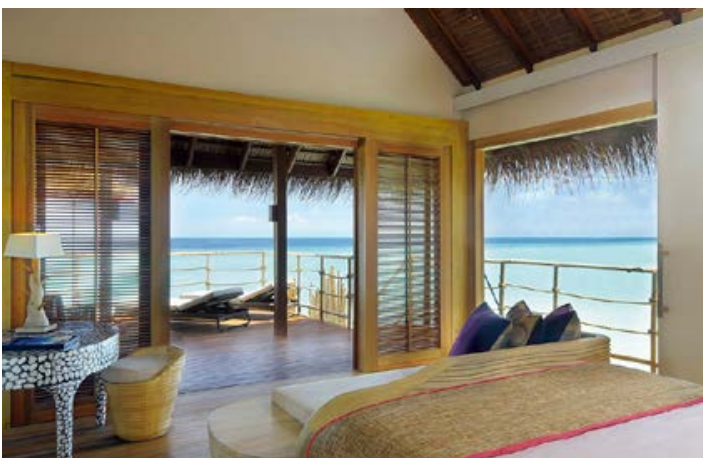
Senior Water Villas

The 56 Water Villas (66m 2 ), all on stilts, are located towards the north of the island. This accommodation can accommodate a maximum of 2 adults + 1 extra bed (adult or child under 12 years) in room.